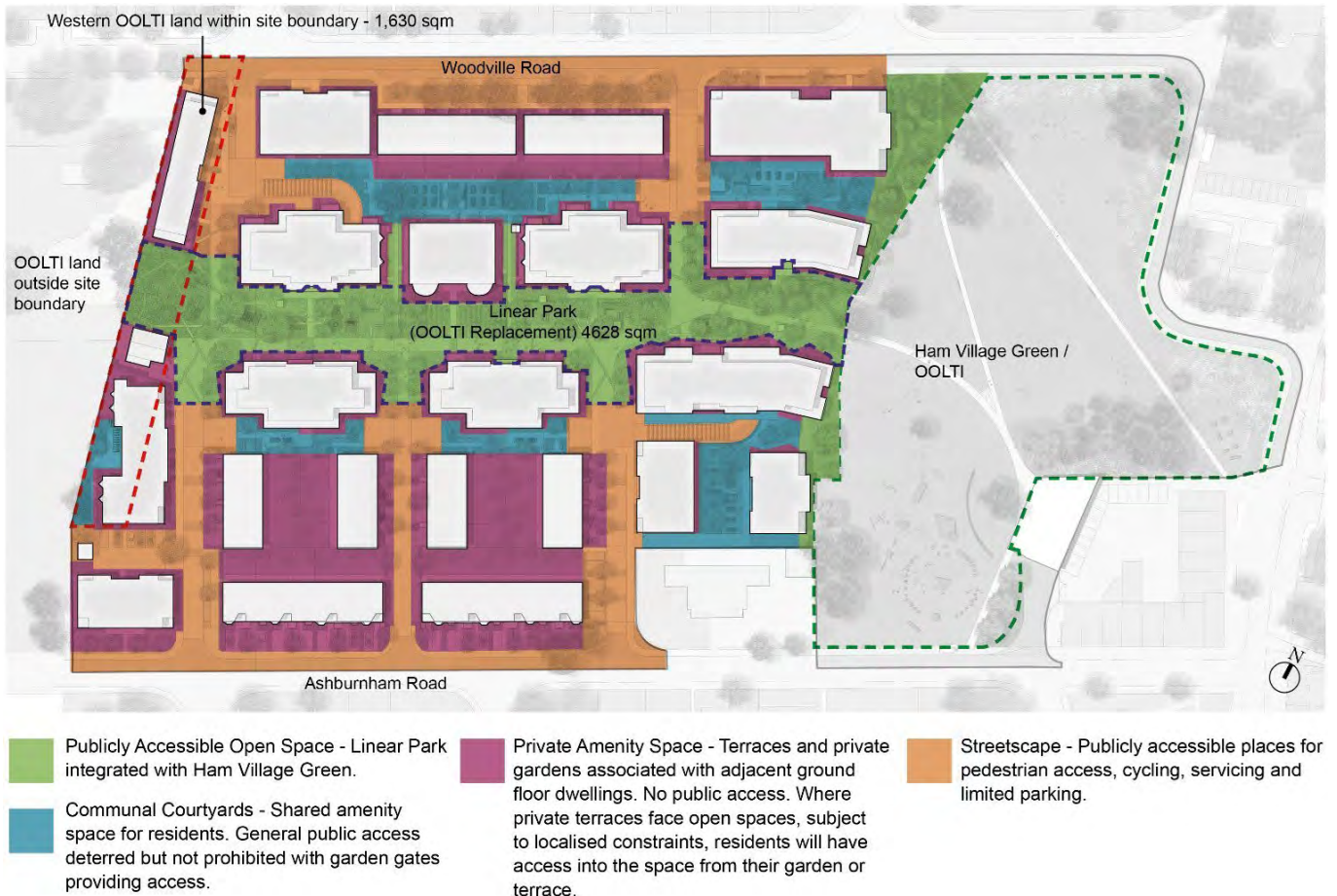
Figure 3.3: Proposed Landscape Masterplan: Spatial Hierarchy