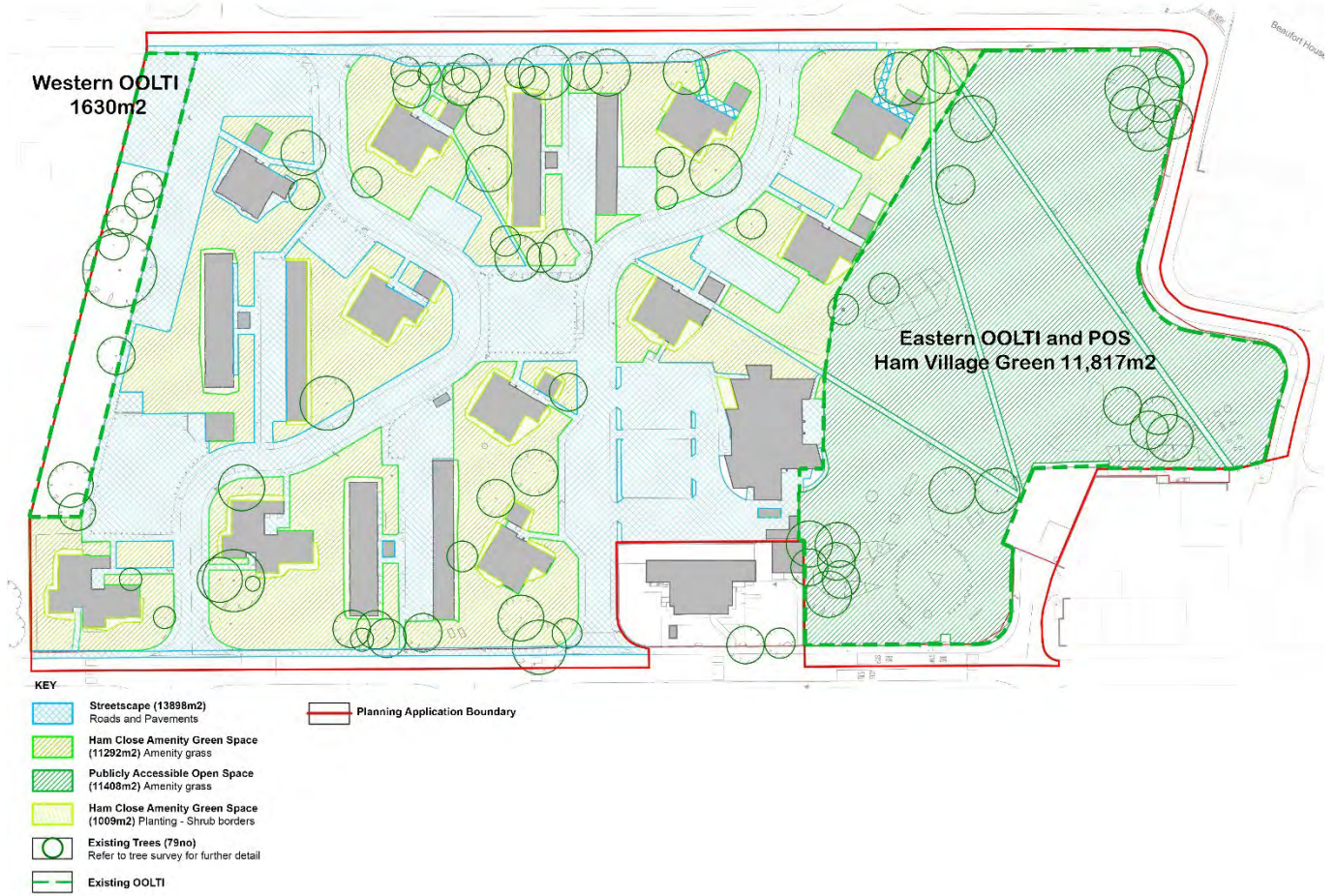
Figure 3.1: Existing site plan and open space typologies