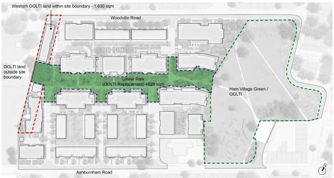
Figure 4.1: Proposed OOLTI Re-provision

4.8 Policy G1: Open Spaces in the Ham and Petersham Neighbourhood Plan requires all green spaces, including Ham Village Green and the western boundary of the development site, which partially comprises the school playing fields/grounds, to be protected. The western strip of land is not currently used as a public open space. Comprising of an overgrown corner of the adjacent school playing field and a section of the Woodville Centre’s private grounds it is not accessible to the public. The proposals will re-provide this space as part of a larger public open space, the Linear Park, which links directly to the Ham Village Green OOLTI enhancing the open space provision (see Figure 4.1 ). The proposed redevelopment of Ham Close will enhance access to, and the setting of, Ham Village Green and result in no loss to this key space.